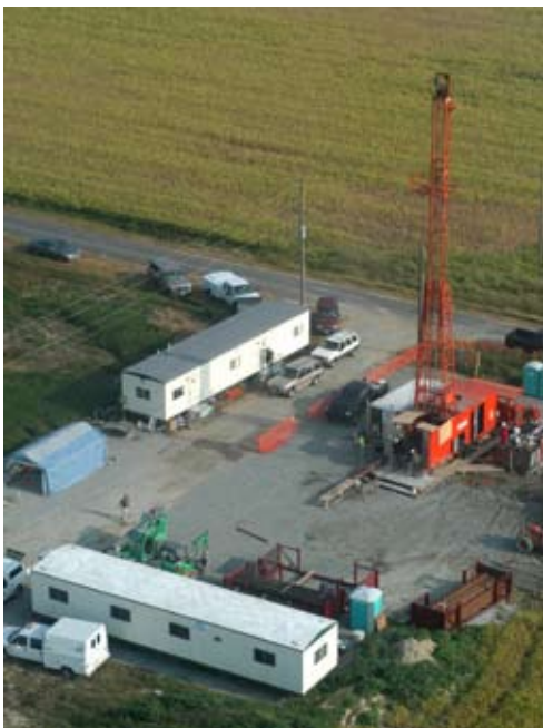
Figure 3. Low-altitude aerial photograph of the Eyreville drilling site.

The huge unexpected megablock of granite encountered at Eyreville presents an example of challenging decision making during the drilling of large impact structures. The coring of hundreds of meters of granite across numerous days eventually implicated that the crater floor already had been penetrated at an unexpectedly shallow depth according to geophysical data. However, it was decided to continue coring, and ultimately the base of the granite was reached, below which a section of suevitic breccias was encountered (Table 2).