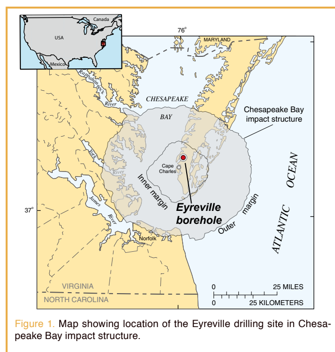
Figure 1. Map showing location of the Eyreville drilling site in Chesapeake Bay impact structure.

The presence of salty groundwater throughout the impact structure is of significant interest to hydrologists studying the future availability of fresh water in the densely populated urban corridor located along the southwestern and southern margins of the structure. Topics of immediate interest that are addressed by the deep borehole include the physical disruption of the aquifer system by the impact, the entrainment and alteration of Eocene seawater, and the effects of the