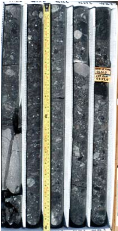
Figure 4. Suevitic and lithic breccia from the Eyreville B borehole.